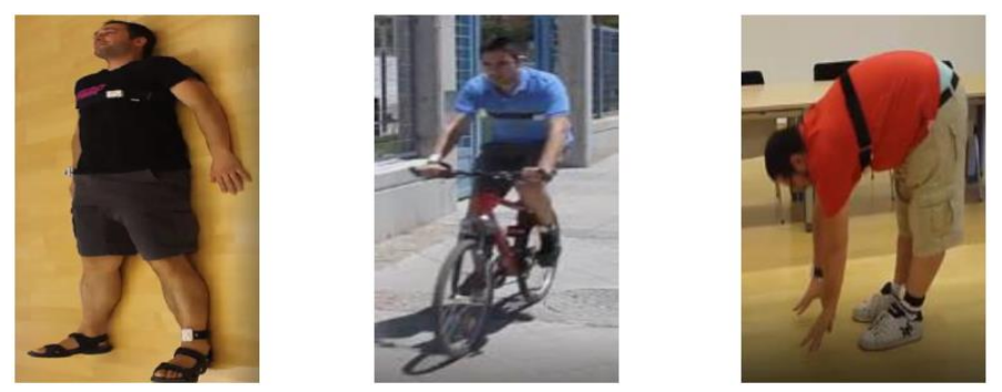
Figure 1 The following figure outlines three subjects' performing three different activities: 'lying down', 'cycling' and 'waist bends forward'. The Shimmer2 [BUR10] wearable sensors which are attached by elastic straps are clearly visible on the subjects' chest, right wrist and left ankle.

We analyse a dataset collected by Oresti Banos, Rafael Garcia and Alejandro Saez that is freely available from The UCI Machine Learning Repository [6]. The MHEALTH dataset consists of body motion and vital signs recordings from ten subjects with each of different characteristics [6][7]. The subjects' task is to perform 12 different types of activities. The accelerometer, gyroscope and magnetometer placed on the subjects' body measure acceleration, rate of turn and magnetic field orientation. These sensors measures the range of motion experienced by each subjects' body parts. The collected dataset comprises body motion and vital recordings of the ten subjects' performing the physical activities as stated above. Shimmer2 [BUR10] wearable sensors were used for the recordings. Elastic straps complement the sensors on the subjects' chest, right wrist and left ankle.