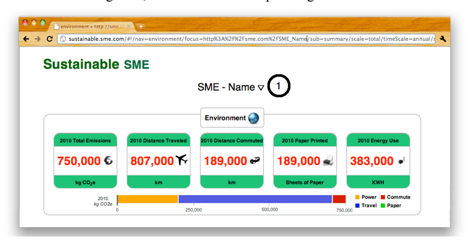
Figure 1: Entity-Centric KPI Overview

the user to pivot between or select multiple entities for comparison. Selection of any of the listed KPIs takes the user to a mode of Figure 2, which allows for expressing more detailed information.