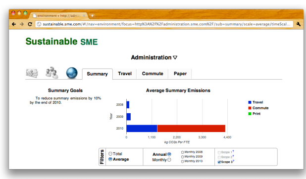
Figure 2a (left): Main Interface